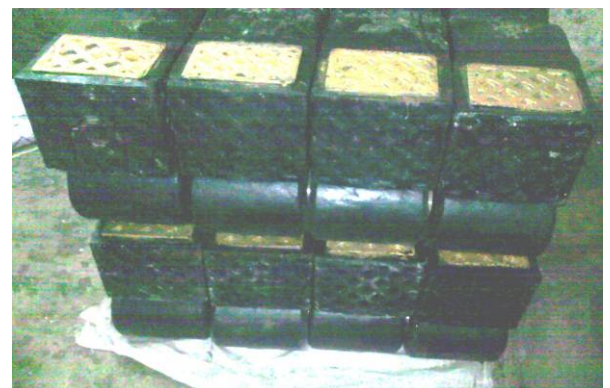
Fig.6 – After assembly and painting Clinker Crushers Hammer with Zuper Block composite sintered carbide are ready for dispatch.