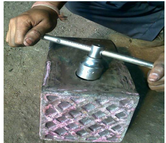
Fig. 3 & 4 - Zuper Block composite sintered carbide assembled with Clinker Crusher Hammer & tighten the bolt with Torque Wrench.