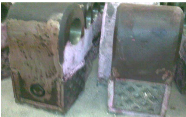
Fig. 5 – Bottom & Top view of Clinker Crusher Hammer with Zuper Block composite sintered carbide