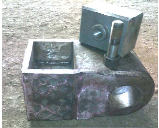
Fig. 1 & 2 – Assembly of Clinker Crusher Hammer with Zuper Block Sintered Composite Carbide